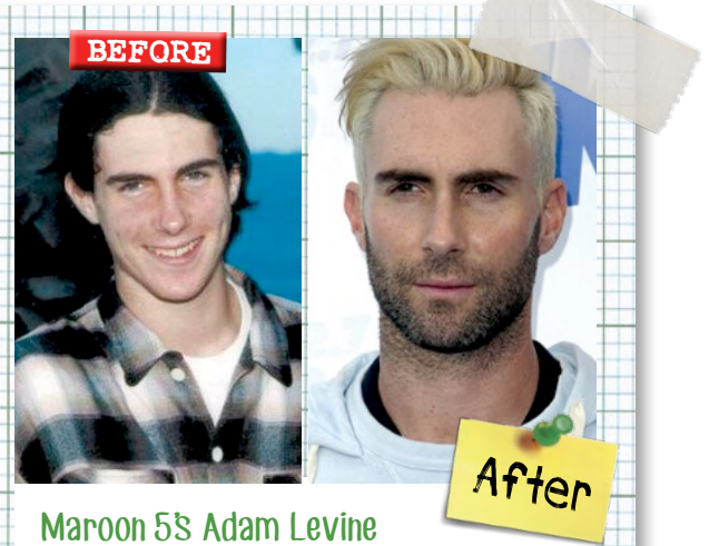
Maroon 5's Adam Levine

This rock and roll bad boy is constantly evolving. He recently dyed his hair blonde, which received mixed reviews from the public. Perfectly self-assured with his image, Adam said that he has learnt to take criticisms as "compliments". However, this heavily tattooed crooner with unique trend-setting haircuts wasn't always the confident style icon we knew. Adam confessed that he used to be a "pretty gross person who wore oversized flannel shirts, had long hair and even sported a goatee." Shocking!